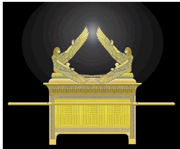
Figure 7. The Ark of the Covenant, showing the covering cherubs with their outstretched wings. This symbolized God's throne in heaven. Satan was once present at the throne room of God; he is called "the anointed cherub who covers..."

The 28 th chapter of Ezekiel describes the spiritual career of Satan. It illustrates when he was originally created he was perfect in wisdom and beauty. He was one of the cherubs that covered the throne of God with his wings. This is typified by the lid, which covered the Ark of the Covenant (Exodus 25:17-22). This lid often termed the mercy seat, where the High Priest went to obtain mercy in God's presence, had two angels (36) covering it with their outstretched wings. See figure 7 (37). Originally Satan was one of the cherubs that covered God with his wings. Satan was an observer of the events that took place in the throne room of God. Satan had a top position in the most important place in the Universe the holy mountain that refers to God's headquarters.