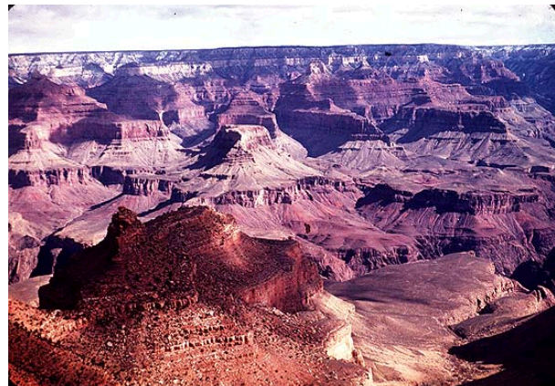
Figure 2. According to the Young Earth Creationists the gap theory is of recent origin and was only formulated to counter the rise of modern geologic theory and its need for the earth to be older than a few thousand years—is this true?

The modern gap theory was proposed in 1814 by Thomas Chalmers, a leading Scottish theologian. Some geologists of his day had argued that the earth was much older than Genesis implies. Chalmers, therefore, proposed the gap theory to harmonize Genesis with the demands of those geologists. There is no clear record of anyone prior to 1814 interpreting Genesis 1:1-2 in this way.