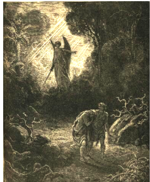
Figure 5. Adam and Eve were driven out of the garden because of sin. Were they the first sinners—or did sin exist before humans?

Sin is the breaking of God's law; it is often termed lawlessness or iniquity. Sometimes sin is equated with breaking of the Ten Commandments. At other times it is the breaking of God's intent or will as defined by his writings or oral commands. Sin involves pride and disobedience.