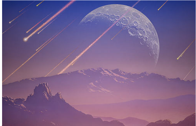
Figure 8. Because of the sin and rebellion of Satan and the angels the Bible indicates there was war in heaven. This heavenly battle caused much astronomical and geological chaos to the earth.

surface and the solar system. There is ample evidence of ancient catastrophic events in the solar system. These include but are not limited to the following: the craters on the moon, the rings of Saturn, Uranus, Neptune, and Jupiter, the asteroid belt which is the complete shattering of another planet, the erratic orbit of Pluto, and Uranus' smaller moon, Miranda, being shattered and then reformed. The whole solar system has scars of past planetary catastrophes. On the earth large craters caused by comets and planetoids have pockmarked its surface. See figure 8 (40). Also the earth has thousands of feet of strata rich in fossil deposits, which indicate that the earth has been through at least one other worldwide catastrophe prior the flood of Noah (41).