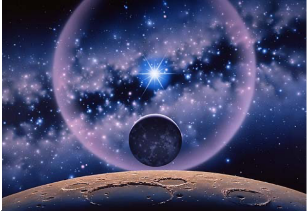
Figure 1. The creation of the heavens and the earth is the topic of the first chapter in Genesis. Were they created only a few thousand years ago or are the heavens and the earth older?

The purpose of writing this paper is to show that there is indeed a gap or a time period between Genesis 1:1 and 1:2, and that the Old Earth Creation the second of the two scenarios listed above is correct. By understanding that this gap exists a better understanding of Bible history will develop. Timothy states that the entire Bible is inspired. It can be used to further clarify the creation account.