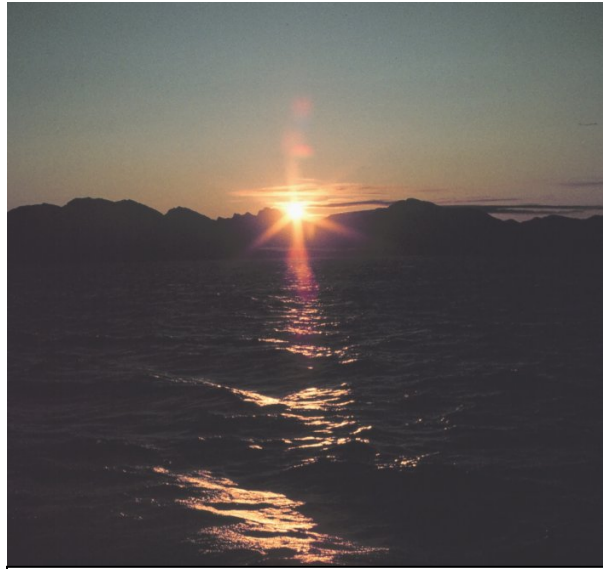
Figure 9. Sunset and Sunrise require a rotating earth and the sun. The sun was not created on day four but was actually created much earlier than the re-creation account in Genesis one.

(Young's) Genesis 1:5 and God calleth to the light 'Day,' and to the darkness He hath called 'Night;' and there is an evening, and there is a morning -- day one.