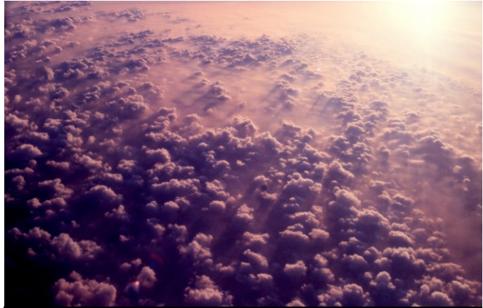
Figure 4. On the fourth day of the re-creation account God allowed the sun, moon, and stars to be visible to an earthbound observer. He did this by clearing the atmosphere of suspended dust, dirt, and clouds.

Verse 16 occurs on the fourth day. What happened on this day is that the heavenly bodies which were created prior to the creation week and already existed were at this time brought forth or appointed to be the rulers of the night and day. What apparently happened is the atmosphere cleared enough that the previously hidden sun, moon, and stars appeared to an earthbound observer. See figure 4 (19). Notice that the words "He made" are in brackets indicating that this is not part of the original Hebrew. The stars were also appointed not created at this time period—the fourth day of the re-creation week. A more correct translation should read as follows: