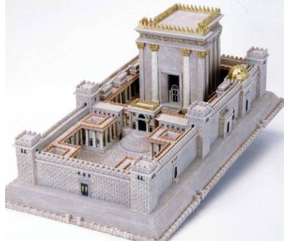
Figure 6. A model of the second temple enlarged by Herod. Like the first temple built by King Solomon they were both built out of white limestone a fossil rich rock.

Solomon's temple was built out of white limestone, see figure 6 (33). King Solomon commissioned King Hiram of Tyre to quarry the stones. King Hiram had 80,000 stonemasons (1 Kings 5:15, 17-18) involved in quarrying the limestone used in the foundation and the walls of the temple. White limestone was used because it is easily worked and when it is finely polished it resembles marble. Limestone is a sedimentary rock that is fossil rich. This means that the temple foundations and walls are built out of rocks, which are mostly fossilized remains of dead carbonate animals (34). It would be impossible for God to have called the temple holy using the Young Earth Creationist's standard for holiness.